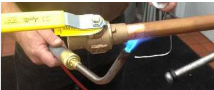
Figure 1 - Preheat tubing

Refer to ASTM B828 "Standard Practice for Making Capillary Joints by Soldering of Copper Tube and Fittings" . Preheat for soldering by concentrating the heat on the tube first, then the valve solder cup, always directing the heat away from body joint. See figure 1. The extent of this preheating depends on the size of tube. After preheating direct the heat on the valve cup area (avoiding the body joint) to aid capillary action in drawing the molten filler metal into the cup. See figure 2.