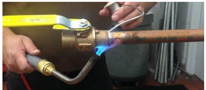
Figure 2 – Heat valve cup area and apply solder