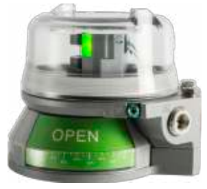
STONEL QUARTZ LIMIT SWITCHES