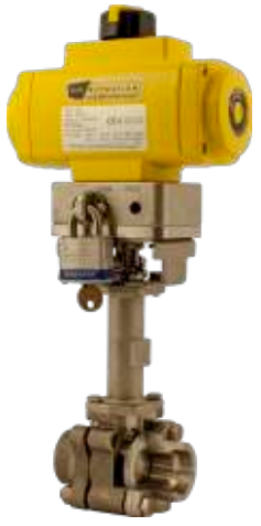
OSHA LOCKOUT DEVICE