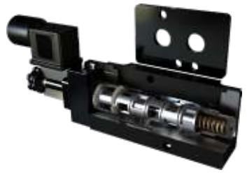
NAMUR MOUNT SOLENOID WITH TRANSITION PLATE