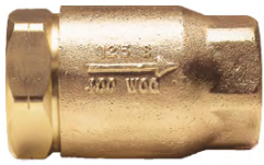
61LF-100 FEMALE x FEMALE THREADED 1/4" THROUGH 3"