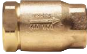
61-100 FEMALE x FEMALE THREADED 1/4" THROUGH 3"