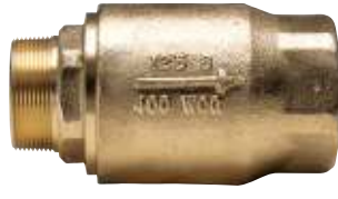
61-200 MALE x FEMALE THREADED 1/4" THROUGH 2"